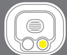
Low battery indicator