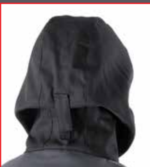
Adjustment system on the back of the hood.

A back length of 121 cm to ensure an efficient protection of the operator until the knees.