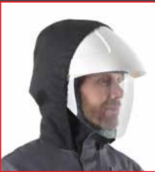
Hood with helmet.

An adjustable hood for a better protection of the head and the neck in case of a higher risk, to be wear with a visor or a helmet.